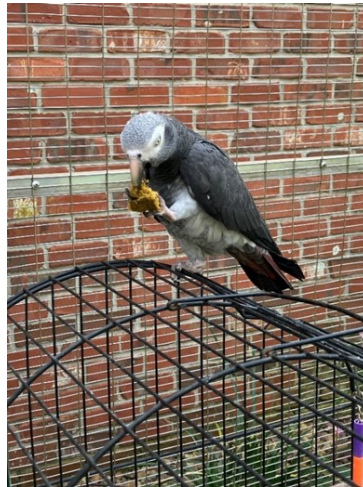
Figure 1: An African Grey Enjoying a Piece of Pellet Birdie Bread