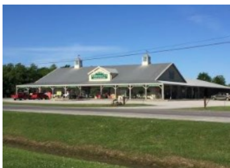
Thibodeaux's Town & Country Inc. 1124 Lafitte Rd., Abbeville, LA